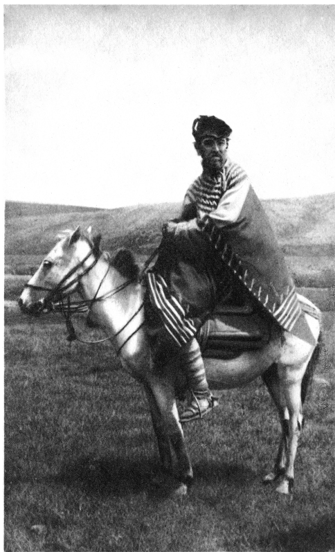
Frater Perdurabo. on the Deosai Plateau. End of his first Himalayan Expedition.