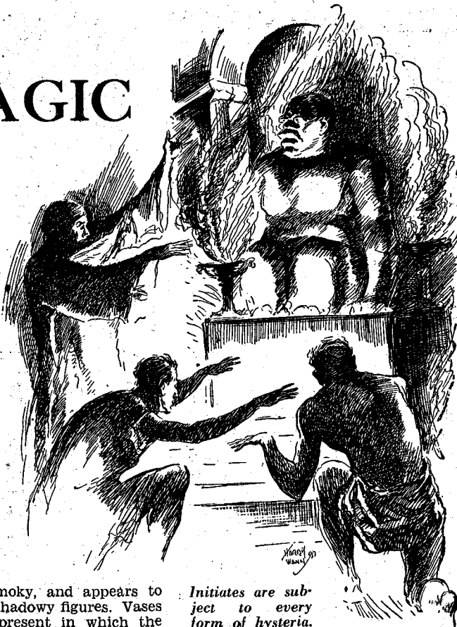
Initiates are subject to every form of hysteria.

Sinister Ceremonies and Primitive Passion Let Loose in London