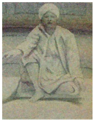
When Crowley "went into the desert with the devil."