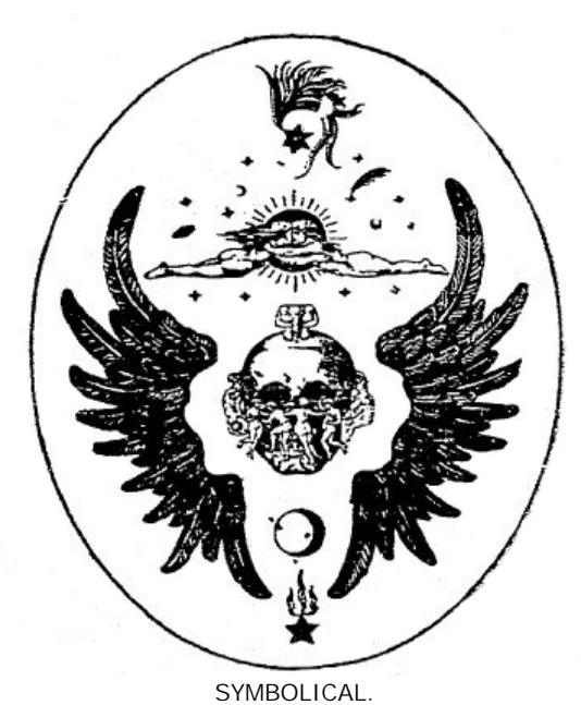
Emblematic Drawing in One of the "O.T.O." Books, Connected with the Revival of Pagan Mysteries and Panic Orgies.