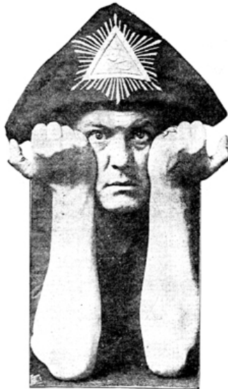
Poet Alister Crowley in a Rosicrucian Attitude. Mr. Crowley Is the Only Member of the Order Who Can Pronounce Correctly the Magic Word "StiBeTTChePhMeFshiSS."

The leader of the movement is Aleister Crowley, a distinguished English poet and literateur. He leads a society which, in 1888, revived the old order of the Rosicrucians, that medieval society of mystics, which even up to the end of the eighteenth century had for its members all the astrologers and alchemists, and most of the great scholars, chemists, and sages. If it had remained as it was two decades ago—a staid community of enthusiasts and dreamers—there would have been no occasion now to remark upon it, save as a curious reappearance of mysticism a modern time.